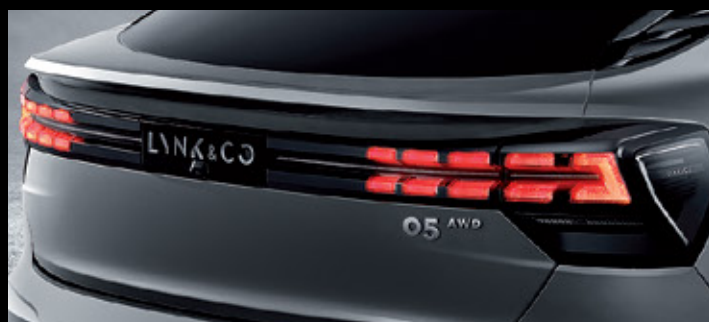
Energy Cube LED Rear Combination Lamps