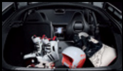
High-capacity Storage Space