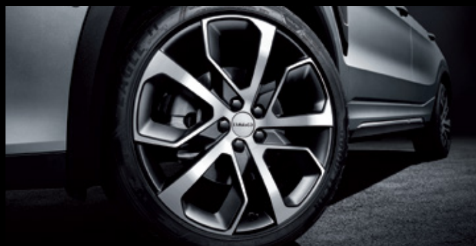
Silver Blade 20-inch Wheel Rim