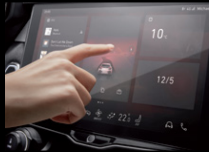
12.7-in. Touchable Center Stack