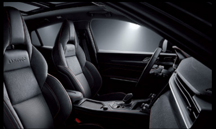
Integrated Sporty Premium Seats