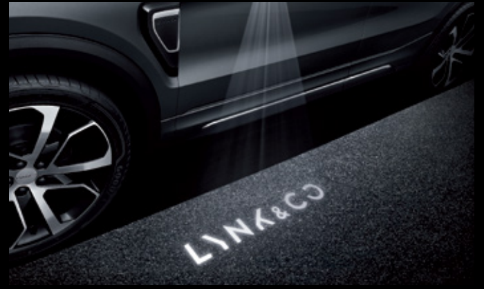
Welcome Ambient Light