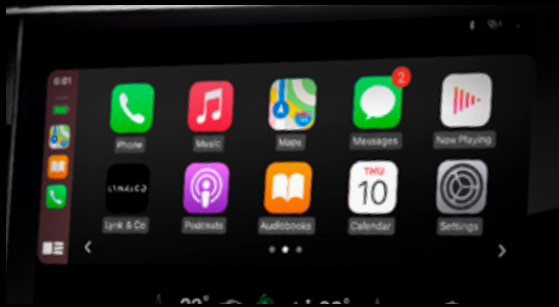
Apple CarPlay & Android Auto

MORE THAN ONE CAN THINK OF. ALL, JUST MY USUAL