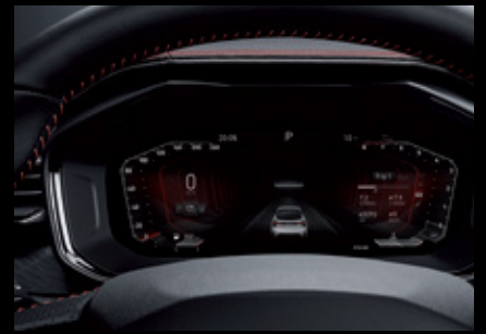
12.3-in. HD Digital Instrument Cluster